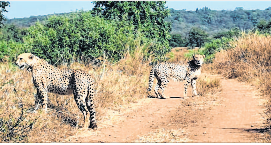
Cheetahs Agni and Vayu after their release into the forest area of Kuno National Park

Both of them would cross boundaries of Kuno. Veera had strayed till the villages of Gwalior in summer, Later, it was brought back inside the enclosures of Kuno. Pawan drowned in a flooded nullah in September. At present, Kuno has 12 adult cheetahs